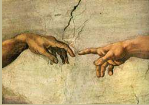
The Creation of Man by Michelangelo Circa 1511 Sistine Chapel

God concludes the day by creating mankind in His own image